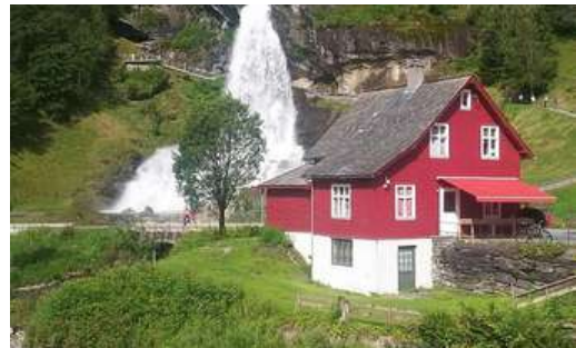
Fossatun Rosselandsvegen 4, Norheimsund