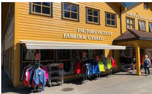
Outlet A-Feltvegen 15, Flåm