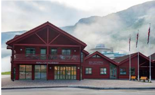
Mall of Norway Stasjonsvegen 9, Flåm