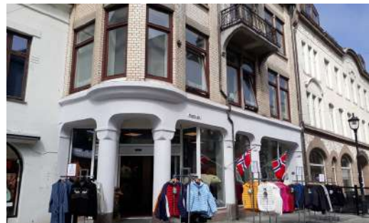
Mall of Norway Ålesund Kongensgate 9, Ålesund