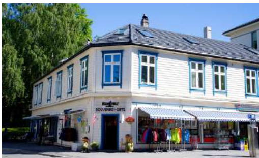
Vossatroll Vangsgata 20, Voss