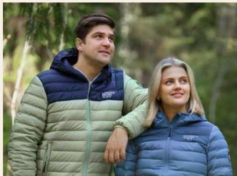
SCANDINAVIAN EXPLORER 71° 10' 21"