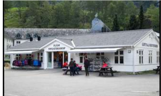
Flåm Sweatershop Fretheim in Flåm